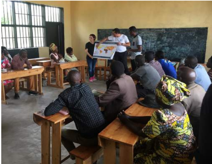
Presentation of the map showing the respect of children's rights to 21 local leaders in Ntongwe, Ruhango (local authorities and teachers)

23 years after the genocide, Rwandan family life is being rebuilt . However, the traumatic experiences lived by these children now turned parents are profound and their recovery rests on fragile foundations. Through its innovative workshops, Humanium trains its local partners to promote social healing and raises the population's awareness of the rights of the child.